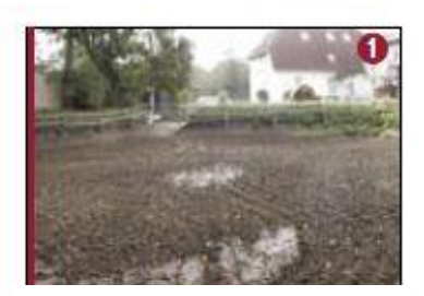
Before installing stability grid make sure that the area is sufficiently dried out !