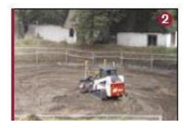
Make sure that the existing area is levelled.