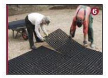
Start laying down the grids with the tabs facing the direction of laying process. The grids self-lock by snapping in with the attached tabs.