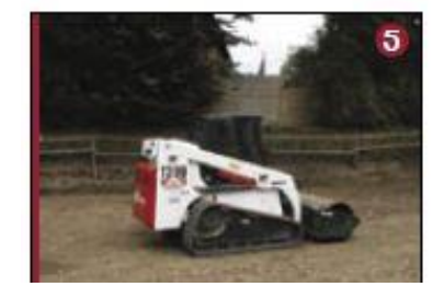
Use 4" of ¾" gravel and compact again.