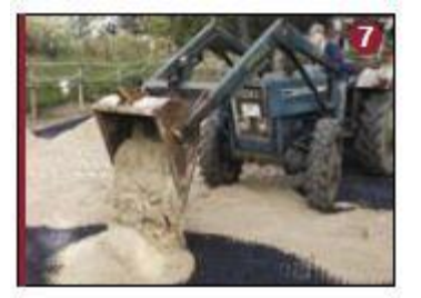
Fill in completely with pea gravel to ensure drainage in the stalls or use stone dust for turnouts.